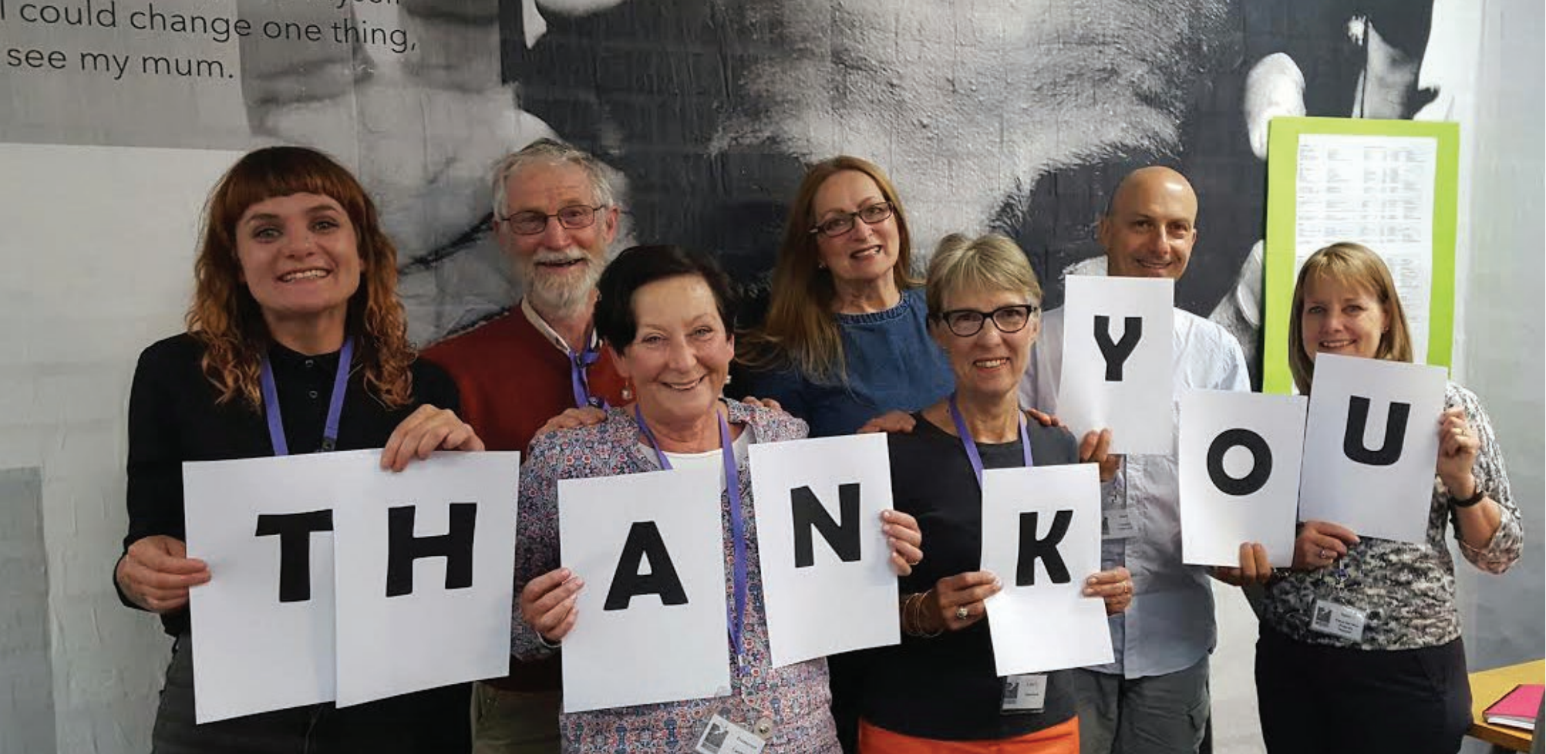
The Asylum Seekers Resource Centre Housing team, recipients of a Lead Project Grant Nov 2016