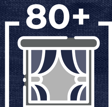
Domestic Violence Services